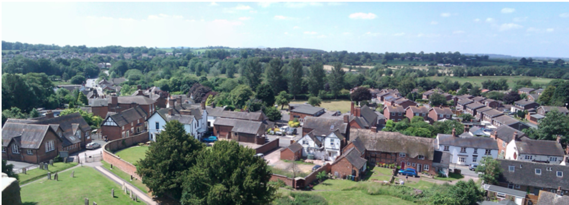
Figure 15: Gnosall Parish Council in Staffordshire worked with partners to identify a site in the village for the development of affordable housing

233. The National Association of Local Councils (NALC) cited as good practice a joint initiative from a group of parish councils in Kent to finance a community transport minibus scheme to aid accessibility. It also highlighted that a number of parish and town councils had worked in partnership to support rural affordable housing, including Gnosall Parish Council in Staffordshire, which had worked with a housing association and building contractor to identify a rural exception site for the development of shared ownership and affordable rented homes. NALC stated that “we would like to see collaboration like this promoted as best practice to ensure that affordable housing remains at the forefront of rural planning policy”. 179