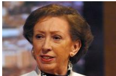
Rt Hon Dame Margaret Beckett DBE MP (Labour)