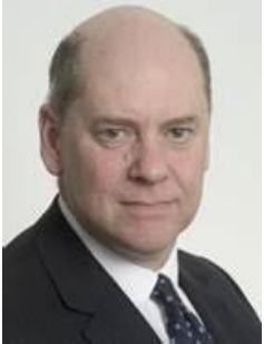
Lord Jonathan Evans of Weardale KCB DL, Chair