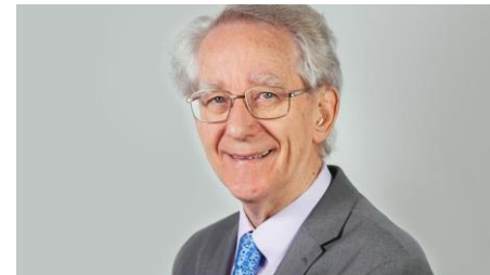
Rt Hon Lord Stunell OBE (Liberal Democrat)