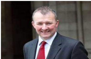
Simon Hart MP (Conservative)