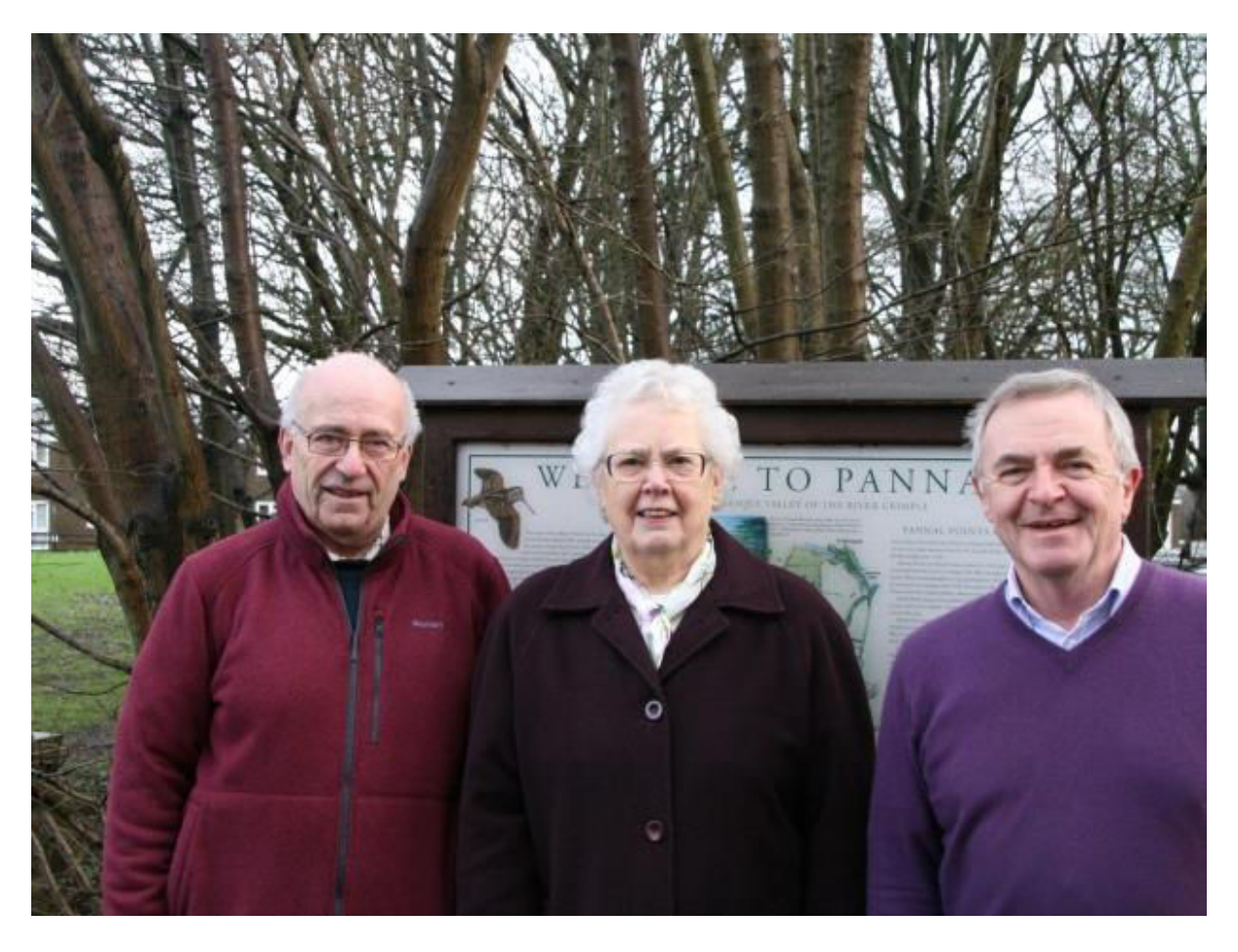
Above; Campaign leaders celebrating their success in establishing a parish council in Pannal.

Harrogate Borough Council launched a consultation with electors and other interested parties between the 12 May and 28 July 2015, which registered 68.7% of responses in favour of the creation of a Pannal and Burn Bridge Parish Council.