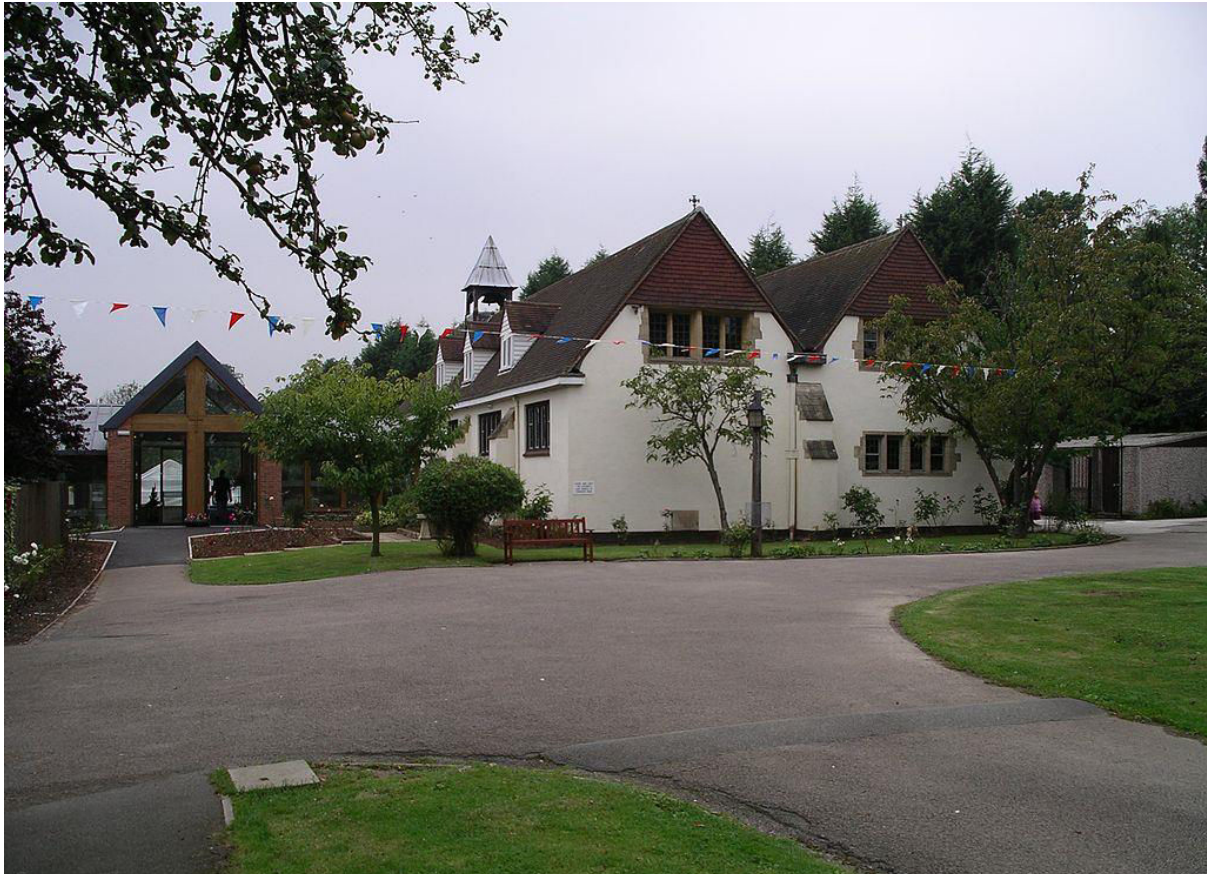
St Martins-in-the-Fields Church, Finham

The petition opened by the Finham Residents' Association collected 711 signatures, more than the minimum required to initiate a Community Governance Review, by December 2013, when it was formally submitted to Coventry City Council. The Community Governance Review commenced the following year, in June 2014. Although Coventry City Council was due to reach a decision in December 2014, due to political implications the decision was postponed until January 2015. In spite of these minor challenges, the establishment of a parish council in Finham has been approved. Coventry City Council found that the population of Finham is large enough to sustain a parish, particularly if it were to take over services from the City Council. Finham Parish Council is awaiting its first elections in May 2016.