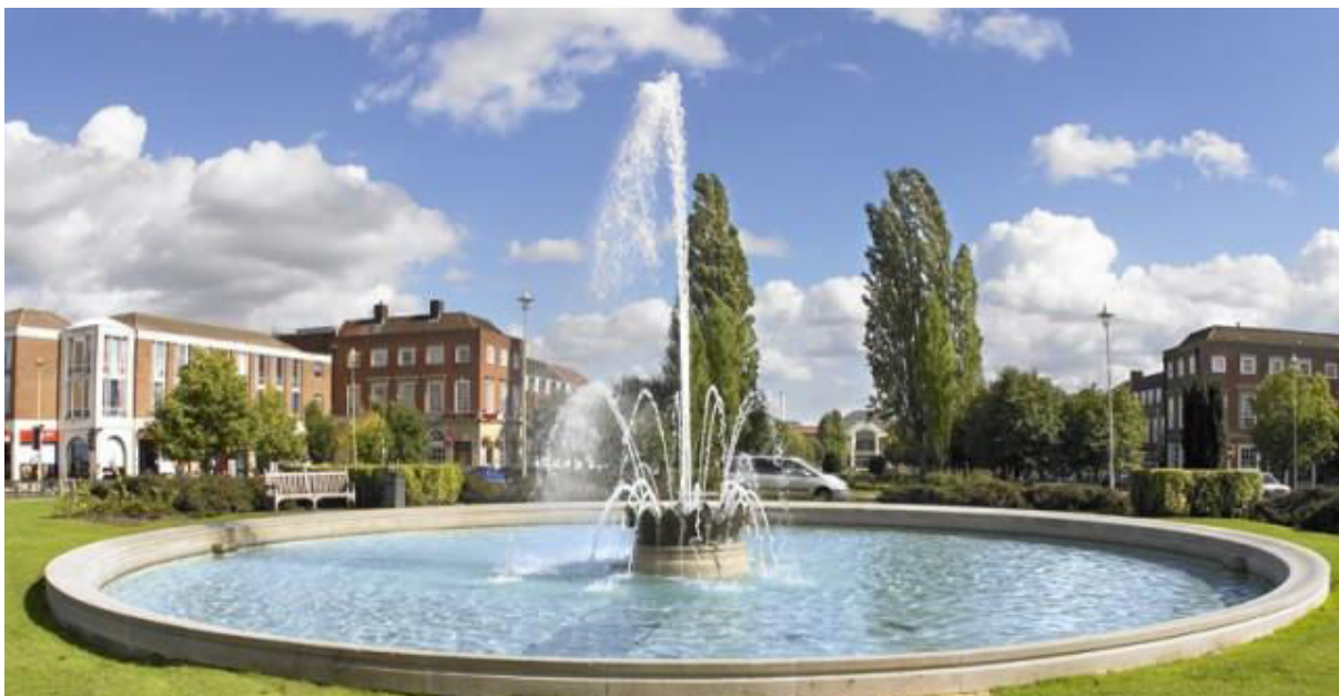
The Parkway Fountain, Welwyn Garden City