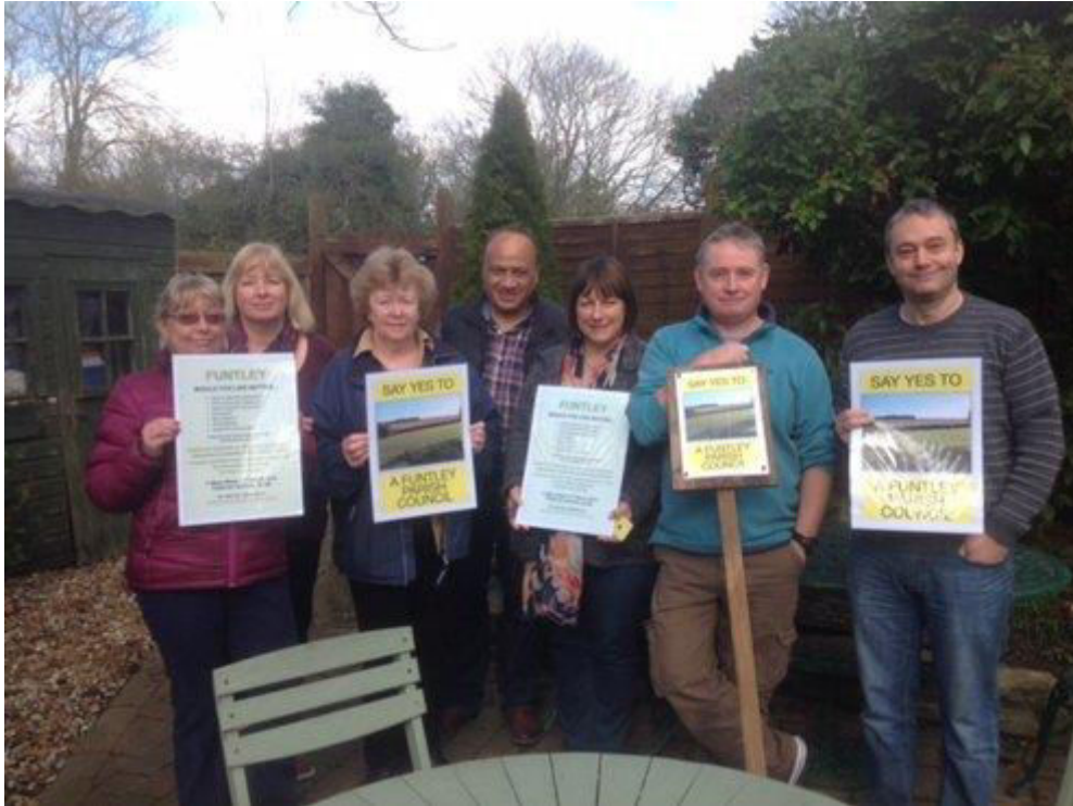
Above: Campaigners campaigning for a new Funtley Parish Council.

(Funtley Village Society web-site, 2016)