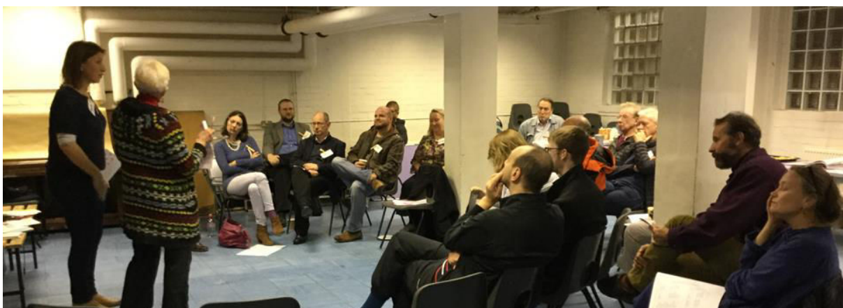
Above: Exploring what Holborn residents want for their community at one of the three public meetings organised in Holborn late in 2015.

HCA started by organising door to door visits and public meetings to explore resident issues and whether there was enough support to establish a community council in Holborn. It was